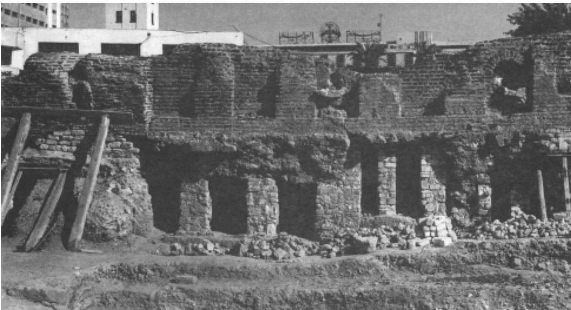
Fig. 2. Northern facade of the cistern.