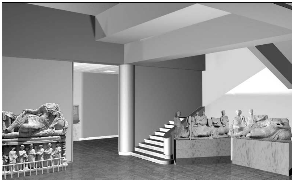
Fig. 3. Refurbished Museum entrance hall. To the right, sarcophagi from the 'Alaine tomb (Rendering D. Tarara)