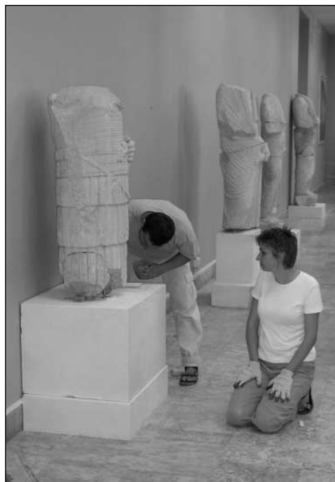
Fig. 2. Restoration work on the archaic statues in the gallery of Allat

Another of the season's tasks was to design a shelter to be erected over the mosaic discovered in 2002-2003. 4 Consultations with colleagues at the DGAM led to the decision to exhibit this nearly complete