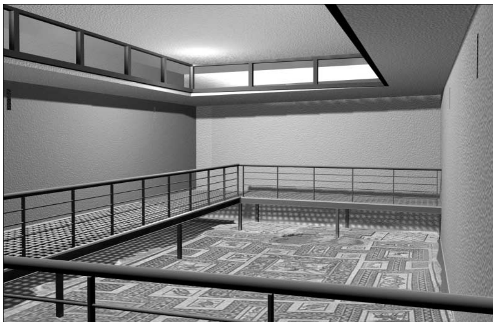
Fig. 1. The interior of the mosaic shelter in computer rendering, facing north (top) and south (Rendering D. Tarara)