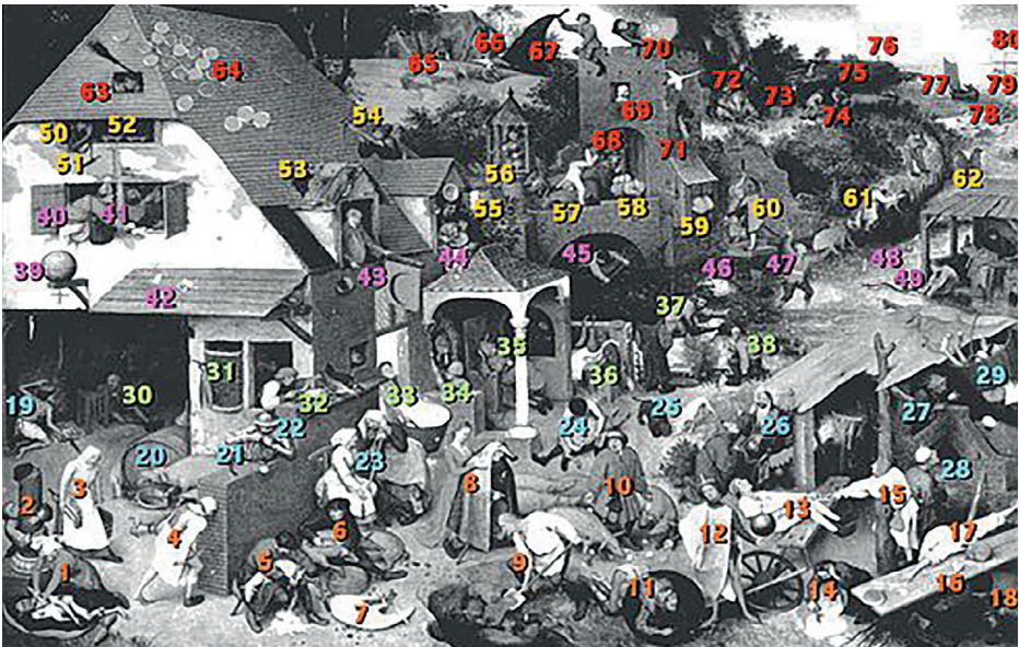
Fig. 2. The Netherlandish Proverbs ( https://upload.wikimedia.org/wikipedia/commons/thumb/c/c9/Bruegel6.jpg/500px-Bruegel6.jpg )