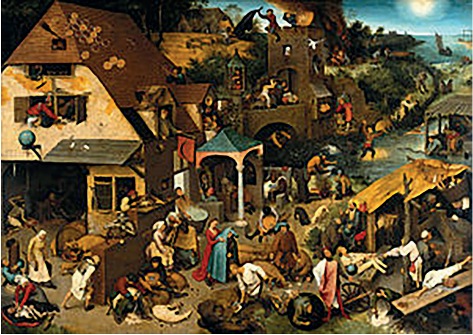
Fig. 1. Pieter Bruegel, the Elder, The Netherlandish Proverbs ( https://upload.wikimedia.org/wikipedia/commons/thumb/7/7e/Pieter_Brueghel_the_Elder_-_The_Dutch_Proverbs_-_Google_Art_Project.jpg/ )