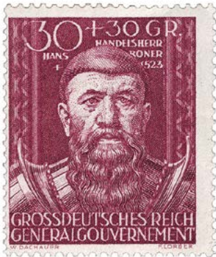
6. Jan Boner, a postage stamp issued by the General Government, 1944

The list of patrician families, especially in Cracow, which thanks to building their financial power and political influence advanced and entered the ranks of nobility, is not particularly short. This phenomenon was exceptionally frequent at the period of the last Jagiellons, before ennoblement became in the Republic extremely difficult. It is not a coincidence that the Prince of Ligne (seeking to obtain the indygenat , i.e. the recognition of his foreign nobility by the Sejm) was to say that it is easier to obtain sovereignty in Germany than nobility in Poland.