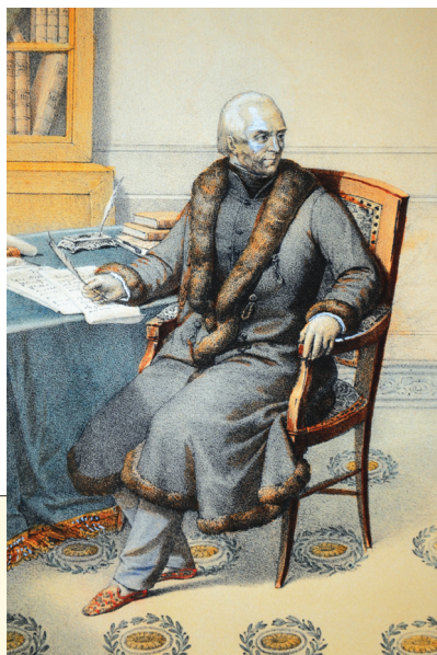
5. Portrait of Stanisław Staszic, steel engraving, after 1826, the Museum of Warsaw

The Kingdom of Poland, commonly and somewhat ironically known as the Congress Kingdom, was born out of the Duchy of Warsaw and was officially proclaimed in Warsaw on 20 July 1815. The scene shown in Bacciarelli's painting therefore concurs with Poland's history, in which Napoleon's place was taken by Alexander I. The transformation