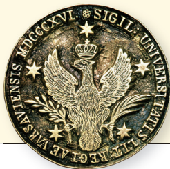
6. Seal of the Royal University of Warsaw, in use until 1823, MUW