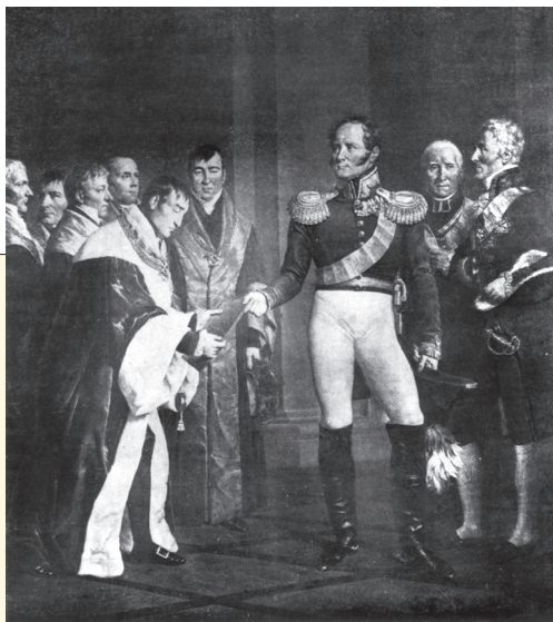
3. Antoni Brodowski, Tsar and King Alexander I Conferring the Document Founding the University of Warsaw , reproduction of a lost painting, 1828