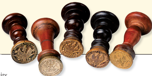
7. Seals of the Royal University of Warsaw, in use until 1823, MUW

articles of the constitution began to be broken with increasing frequency. In his famous Powstanie narodu polskiego [The Rise of the Polish Nation], Maurycy Mochnacki wrote: “To show to Europe he [Alexander I] had constitutional rituals, orations at the opening and closing of the parliamentary sessions. To take all power away from the constitutional decree, to introduce in the Congress Kingdom of Poland the same absolutism with which he ruled Moscow, he had his brother”. 19 That brother was, of course, the Grand Duke Constantine, who was truly hated not only in Warsaw; a man whose behaviour and decisions manifested an almost paranoid despotism. His actions were supported by the ubiquitous tsarist commissar Nikolai Novosiltsov, by an army of informers which, particularly after 1822, had vastly increased in numbers, and by ever more severe and rigorous censorship.