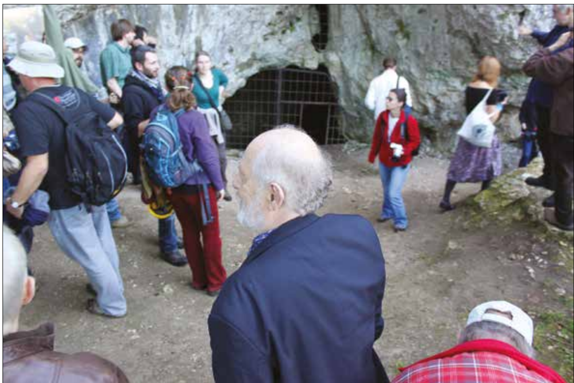
Fig. 2. Prof. S. K. Kozłowski at the entrance to the Biśnik Cave, during the field session of the conference “European Middle Palaeolithic during MIS 8 – MIS 3: Cultures – Environment – Chronology”, 26 th of September 2012.