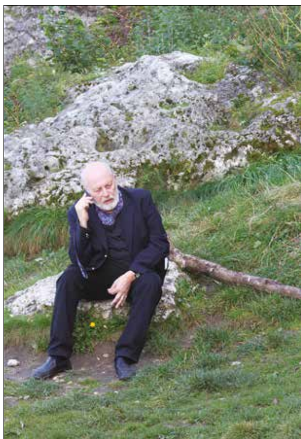
Fig. 3. Prof. S. K. Kozłowski in front of the Stajnia Cave, during the field session of the conference “European Middle Palaeolithic during MIS 8 – MIS 3: Cultures – Environment – Chronology”, 26 th of September 2012.