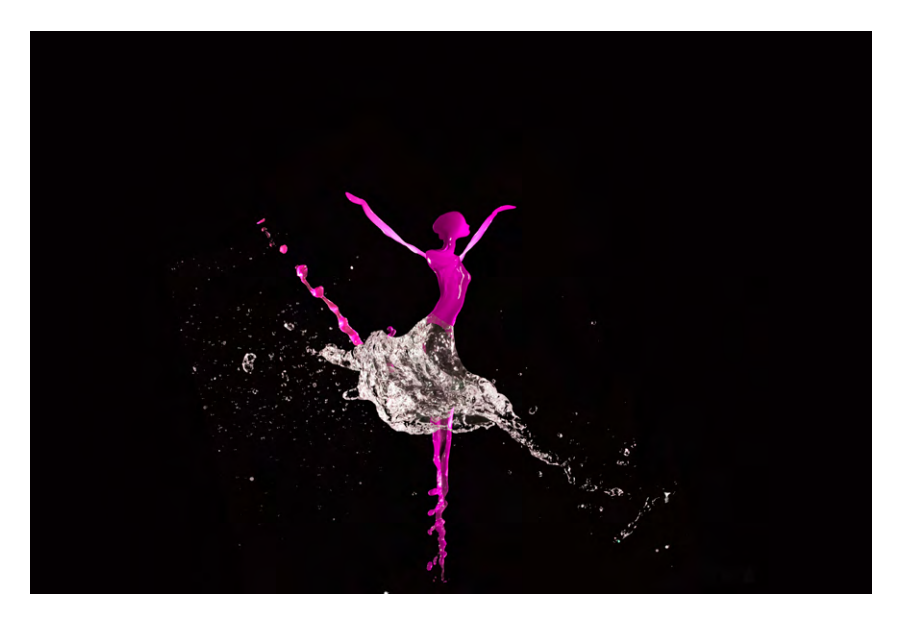
Don't wait for the storm to pass, learn to dance in the rain

It is a great honor for me that you are reaching for this book. From now on, we will not run away from the rain, we will start dancing together in it.